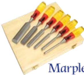
Marples Chisel Set