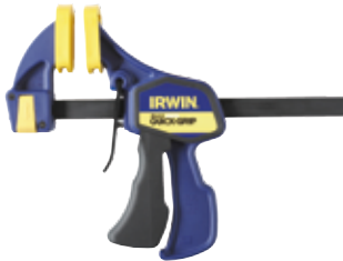
Quick Grip Clamp