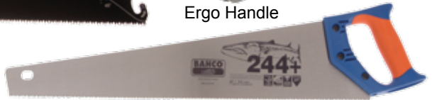
Barracuda Hand Saw