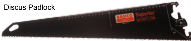
Ergo 22" Blade