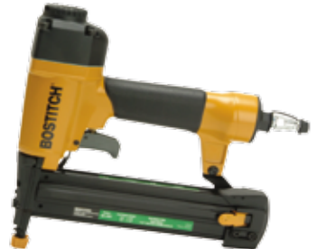
Pneumatic Stapler / Bradder